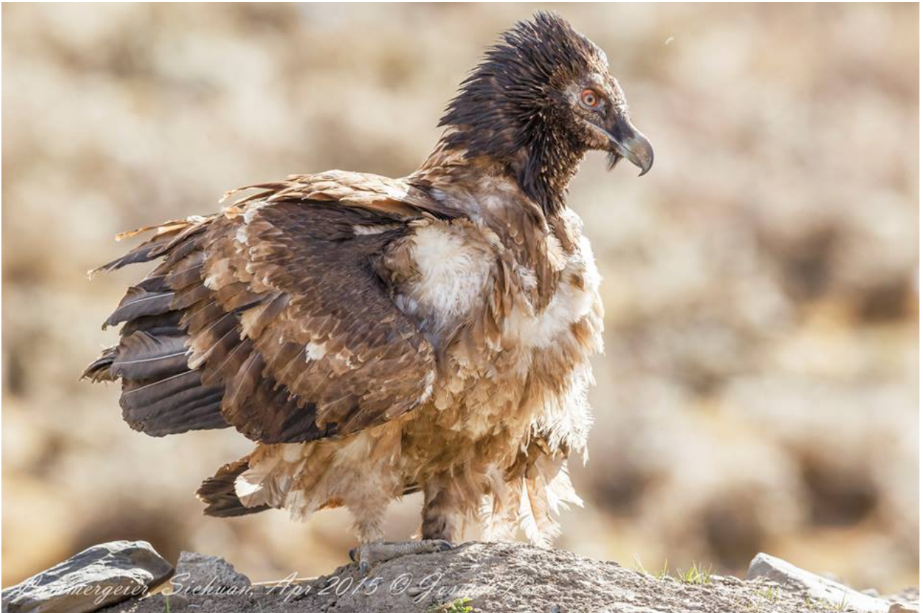
Lammergeier, Sichuan, Apr 2015