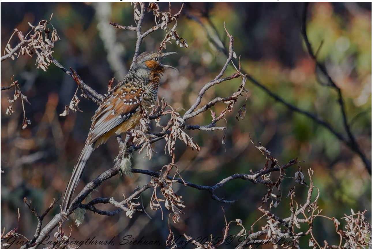
Giant Laughingthrush, Maer King, Sichuan, China