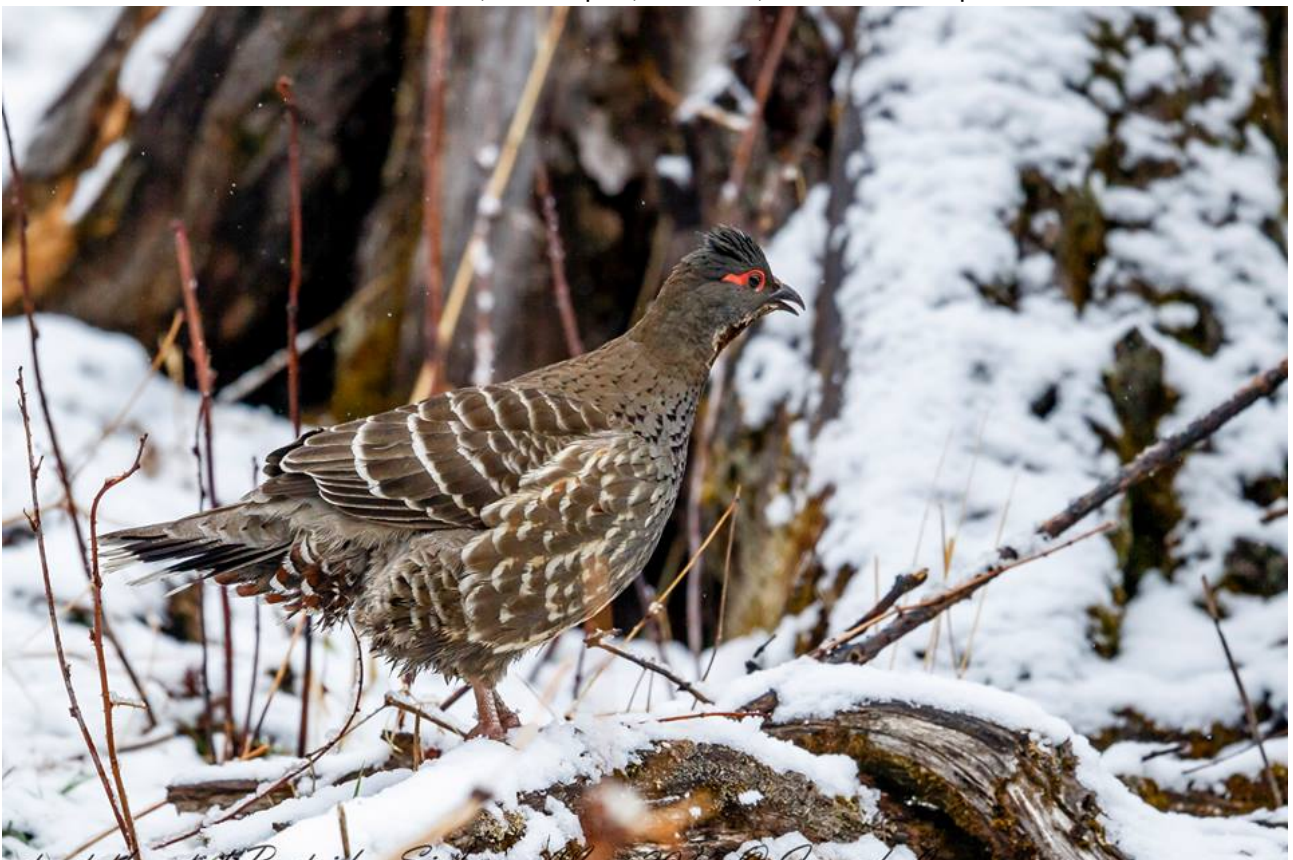
Verreaux's Monal Partridge ( Chestnut-throated Partridge), Northern Sichuan, China