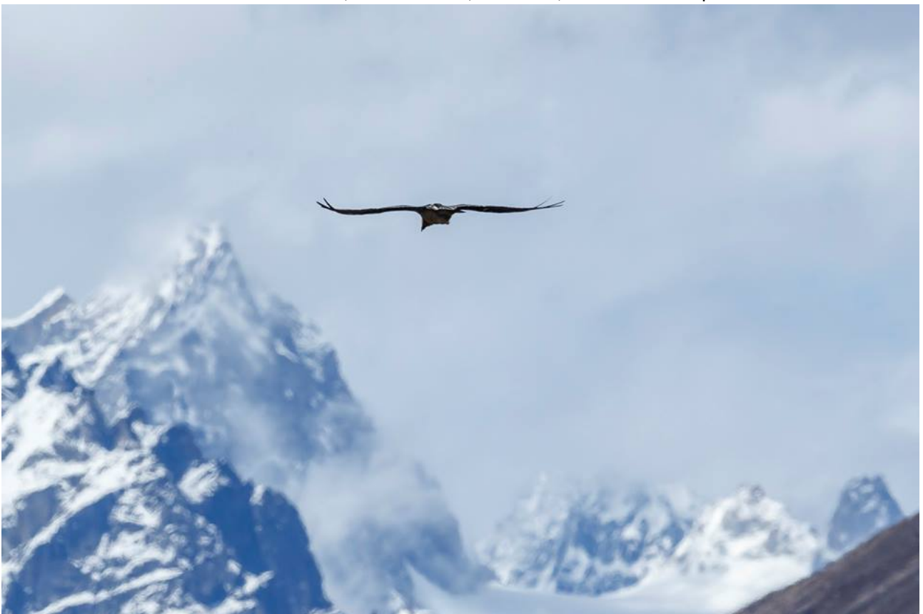
Lammergeier in Balang Shan, Sichuan, China