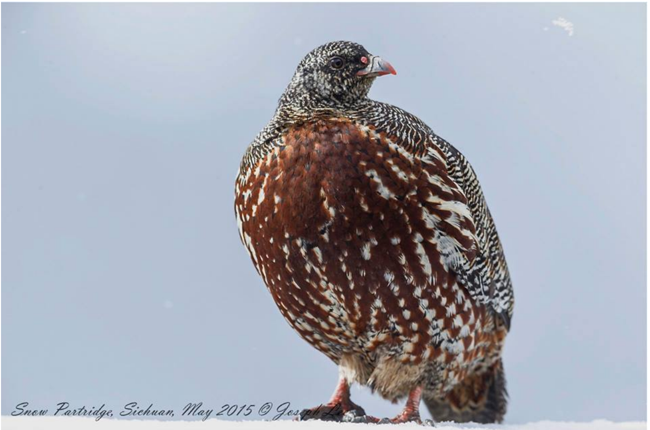
Snow Partridge, Sichuan, May 2015