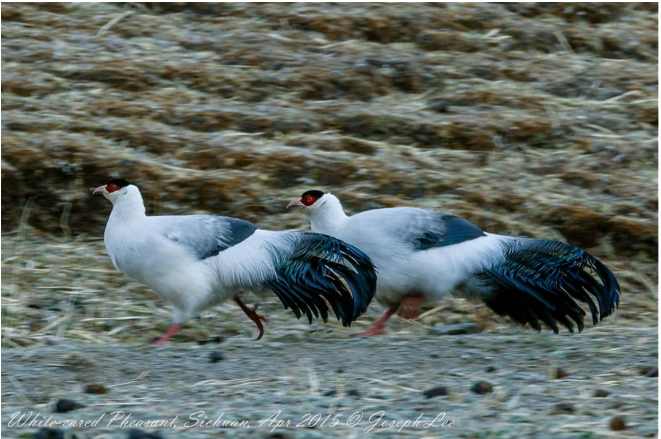
White-eared Pheasant, Sichuan, Apr 2015