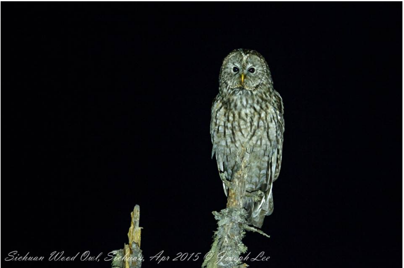
Sichuan Wood Owl, Northern Sichuan, China