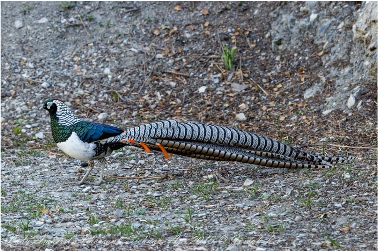
Lady Amherst's Pheasant photographing from a bird hide, Kangding, Sichuan, China