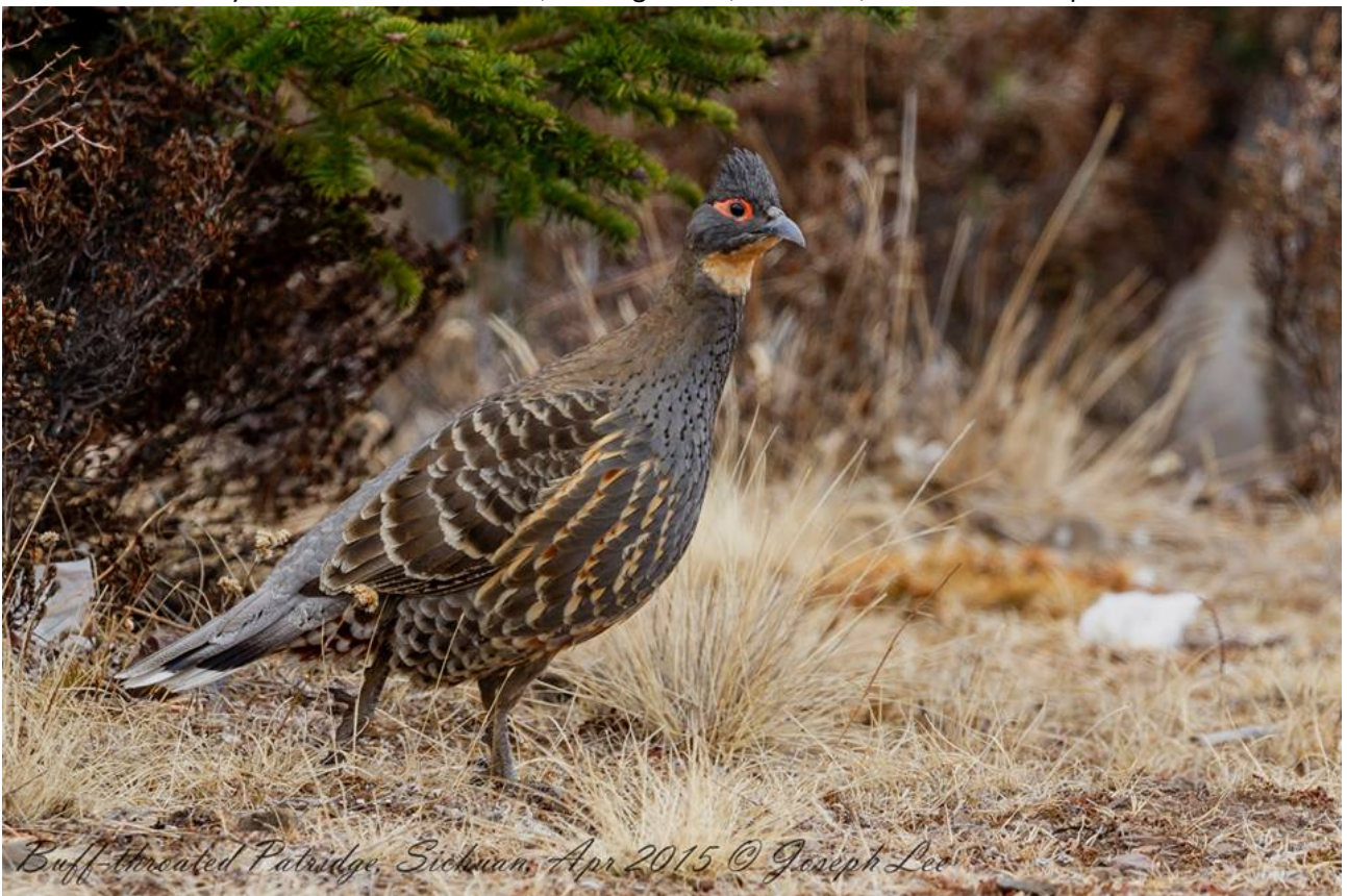
Szechenyi's Monal Partridge ( Buff-throated Partridge ), Pamuling, Sichuan, China © Joseph Lee