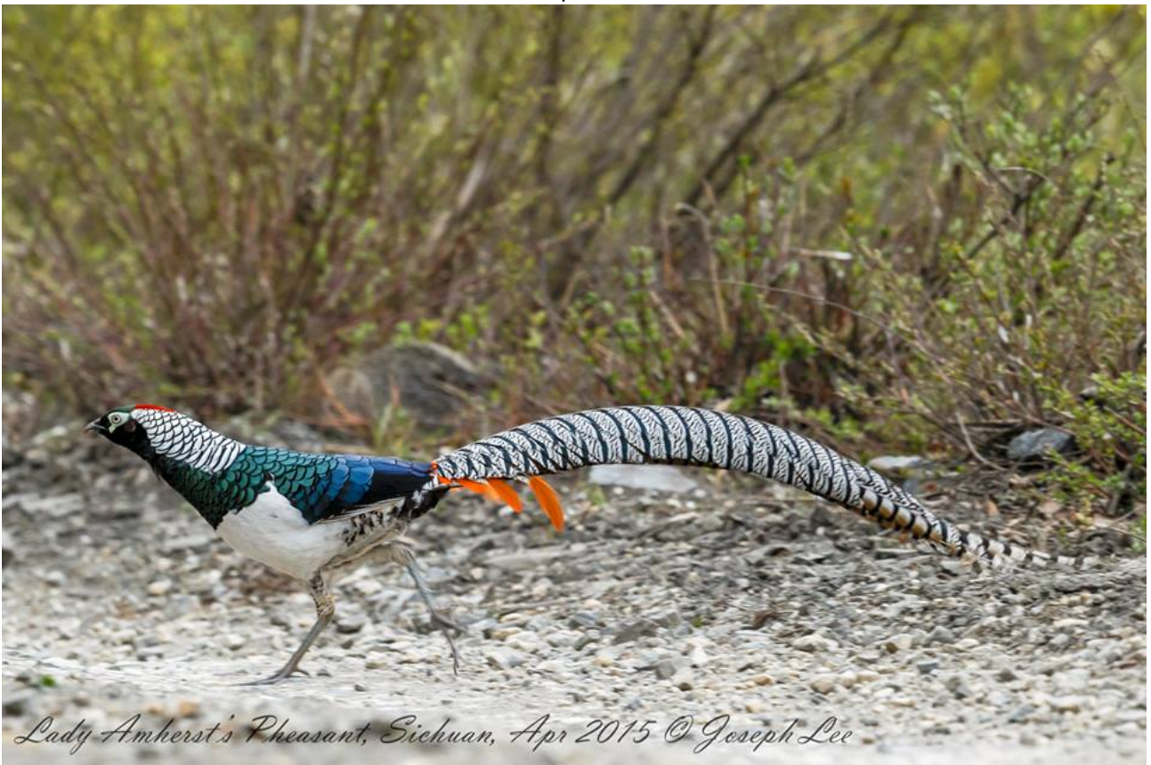
Lady Amherst's Pheasant, Gold Mine Road, Kangding, Sichuan, China