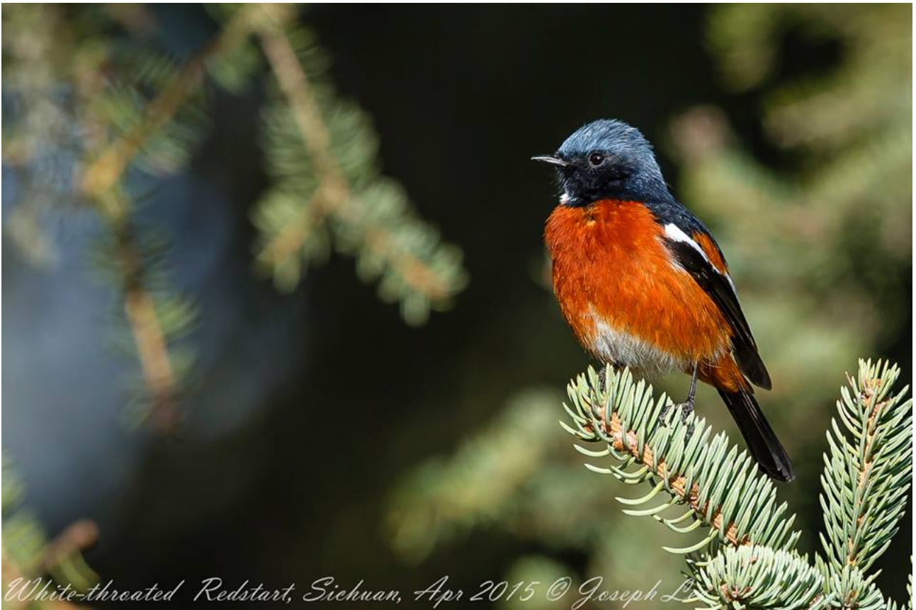
White-throated Redstart, Sichuan, Apr 2015