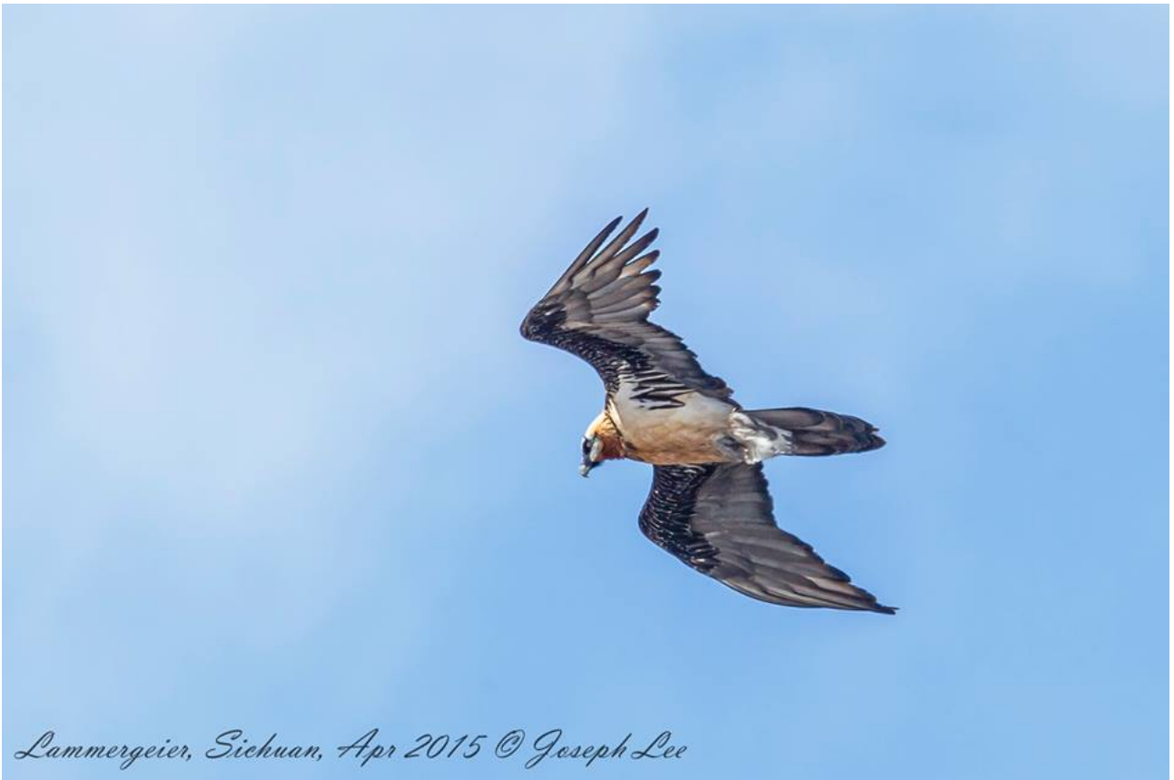
Lammergeier, Sichuan, Apr 2015