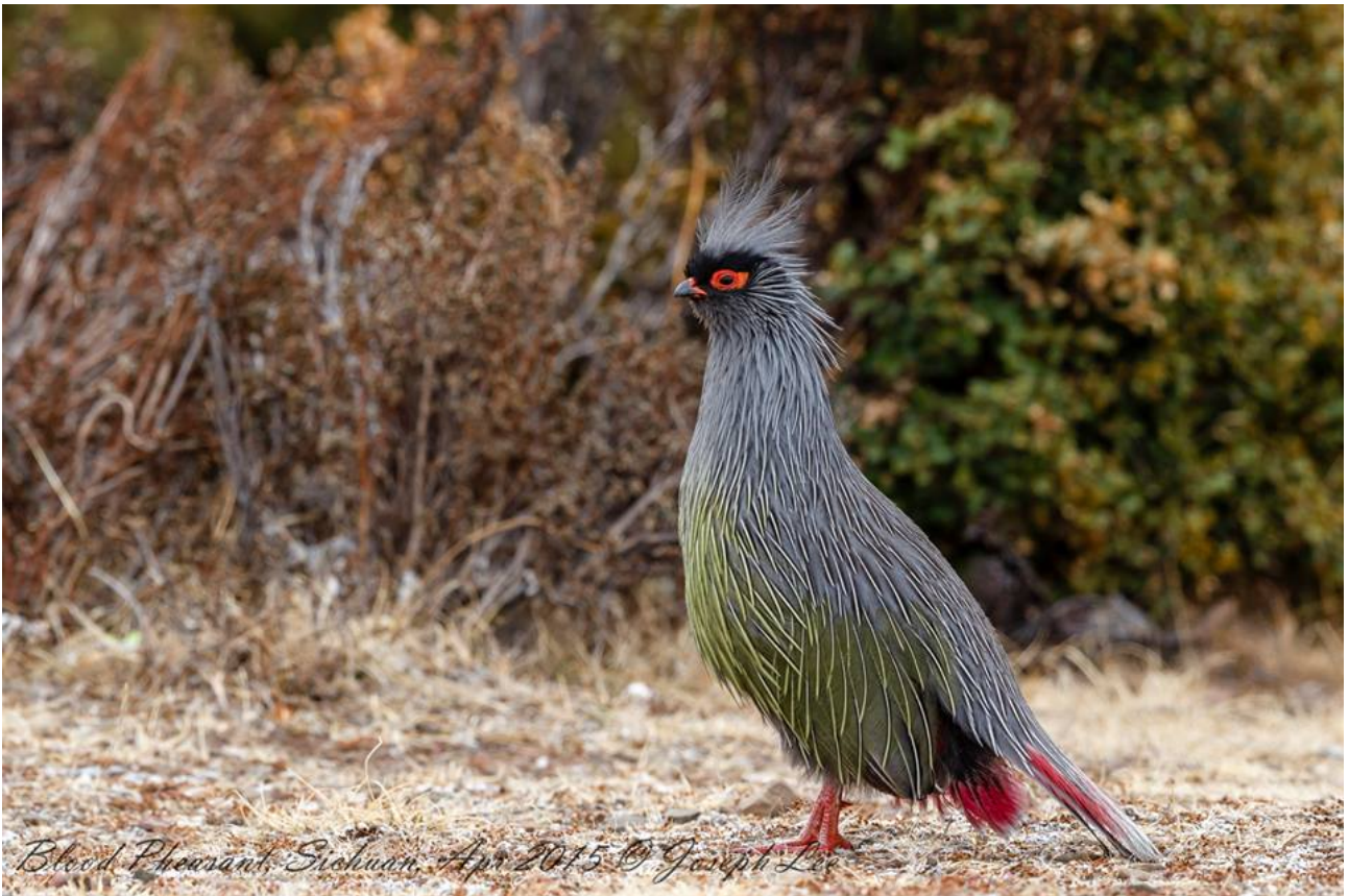
Blood Pheasant, Xinduqiao, Western Sichuan, China