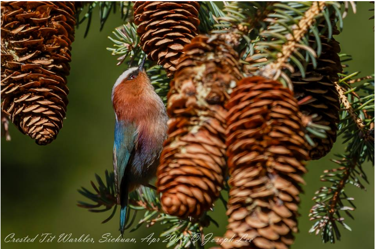
Crested Tit Warbler, Sichuan, Apr 2015