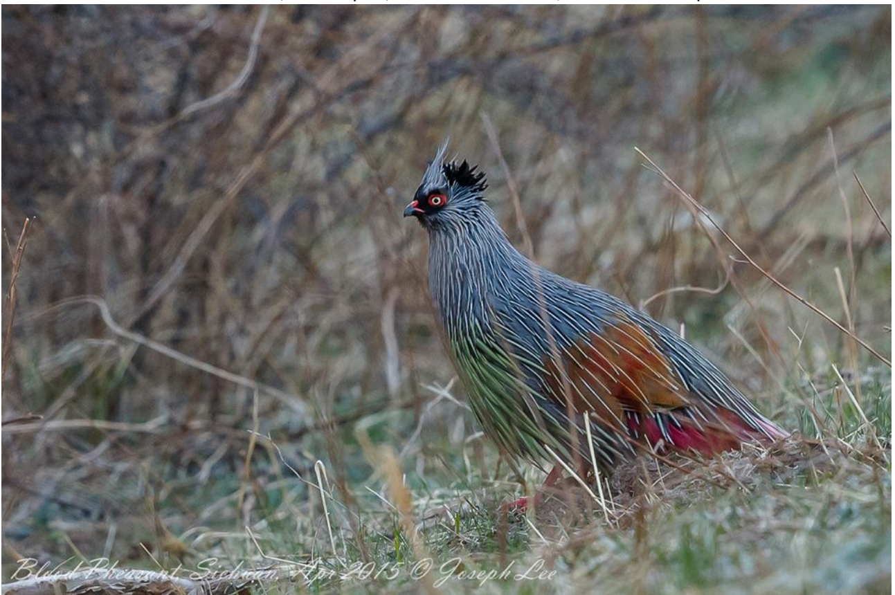
Blood Pheasant, Ruergai, Northern Sichuan, China