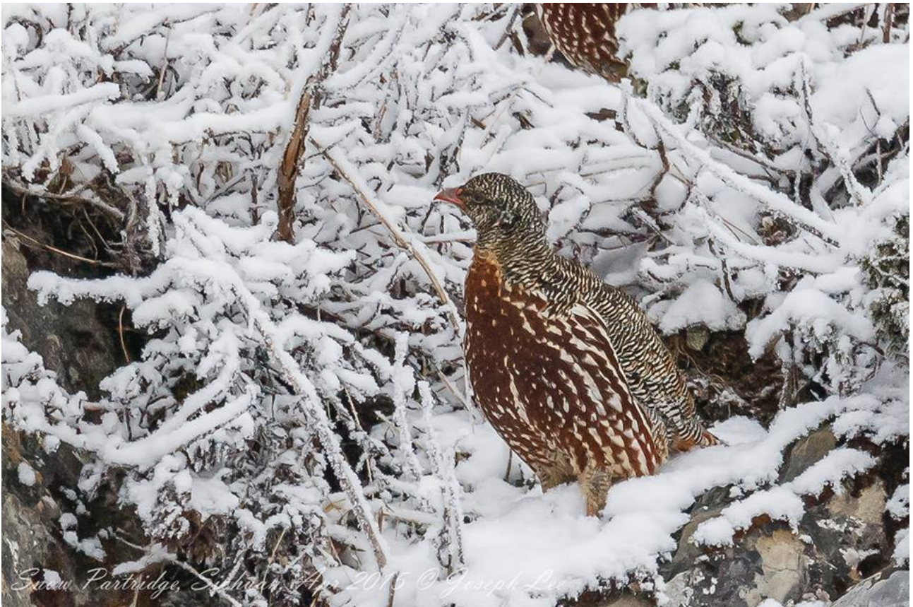
Snow Partridge, Balang Shan, Sichuan, China