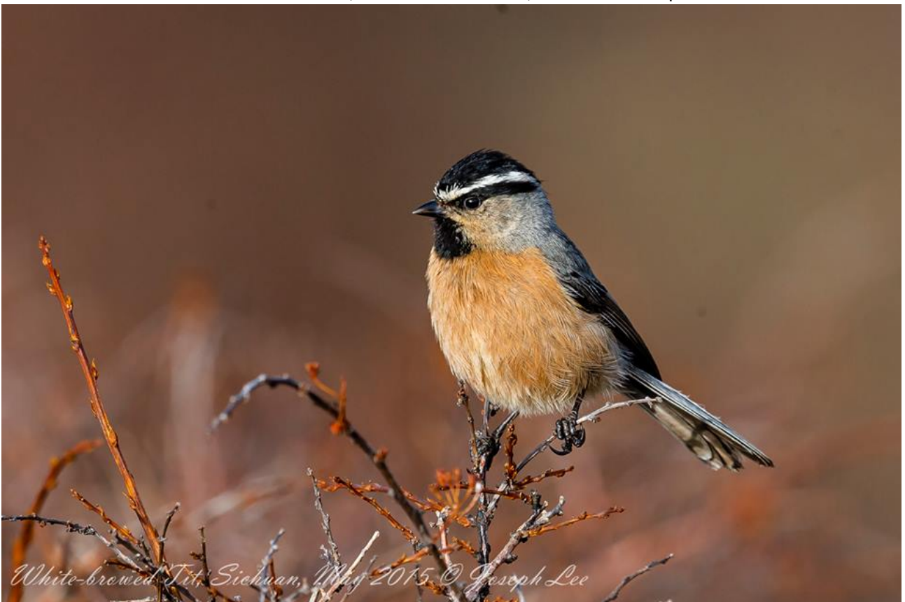
White-browed Tit, Ruergai, Sichuan, China