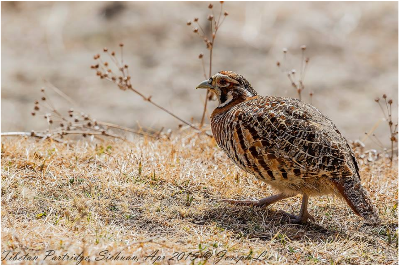
Tibetan Partridge, Sichuan, Apr 2015