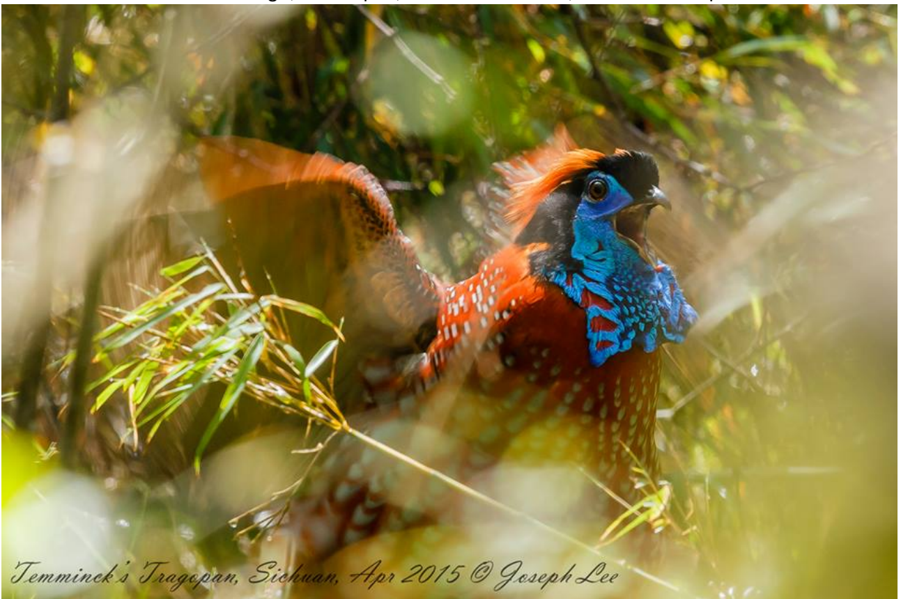
Temminck's Tragopan, Sichuan, Apr 2015