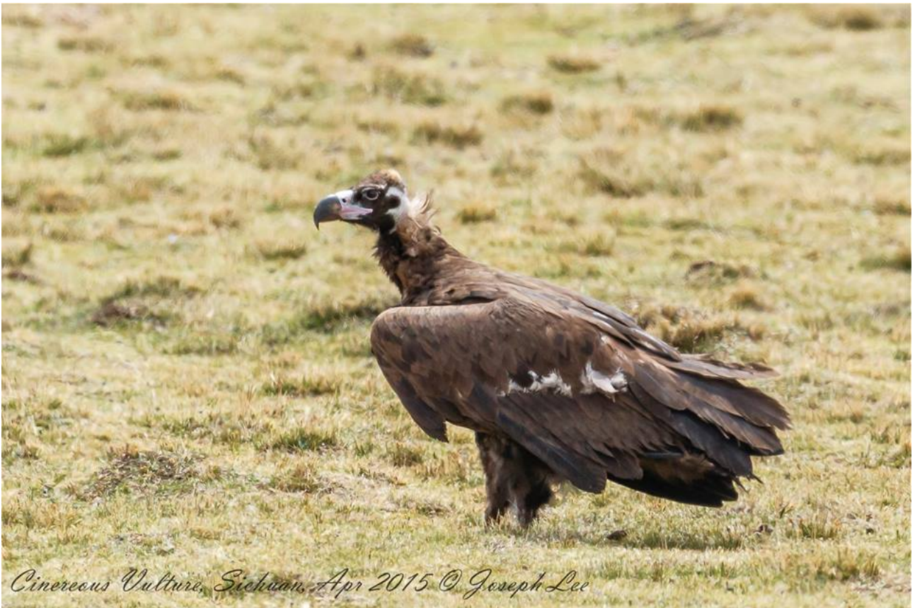
Cinereous Vulture, Sichuan, Apr 2015