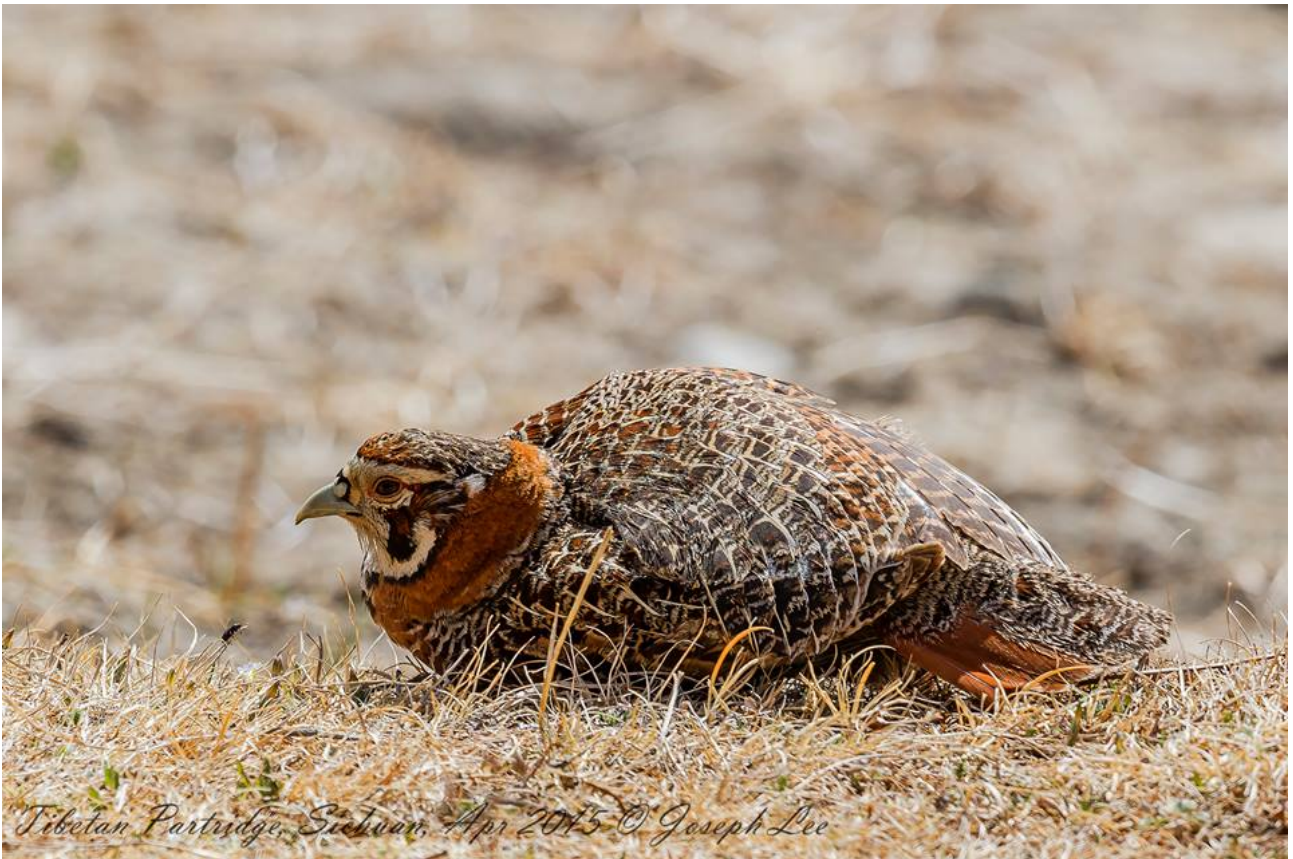
Tibetan Partridge, Sichuan, Apr 2015