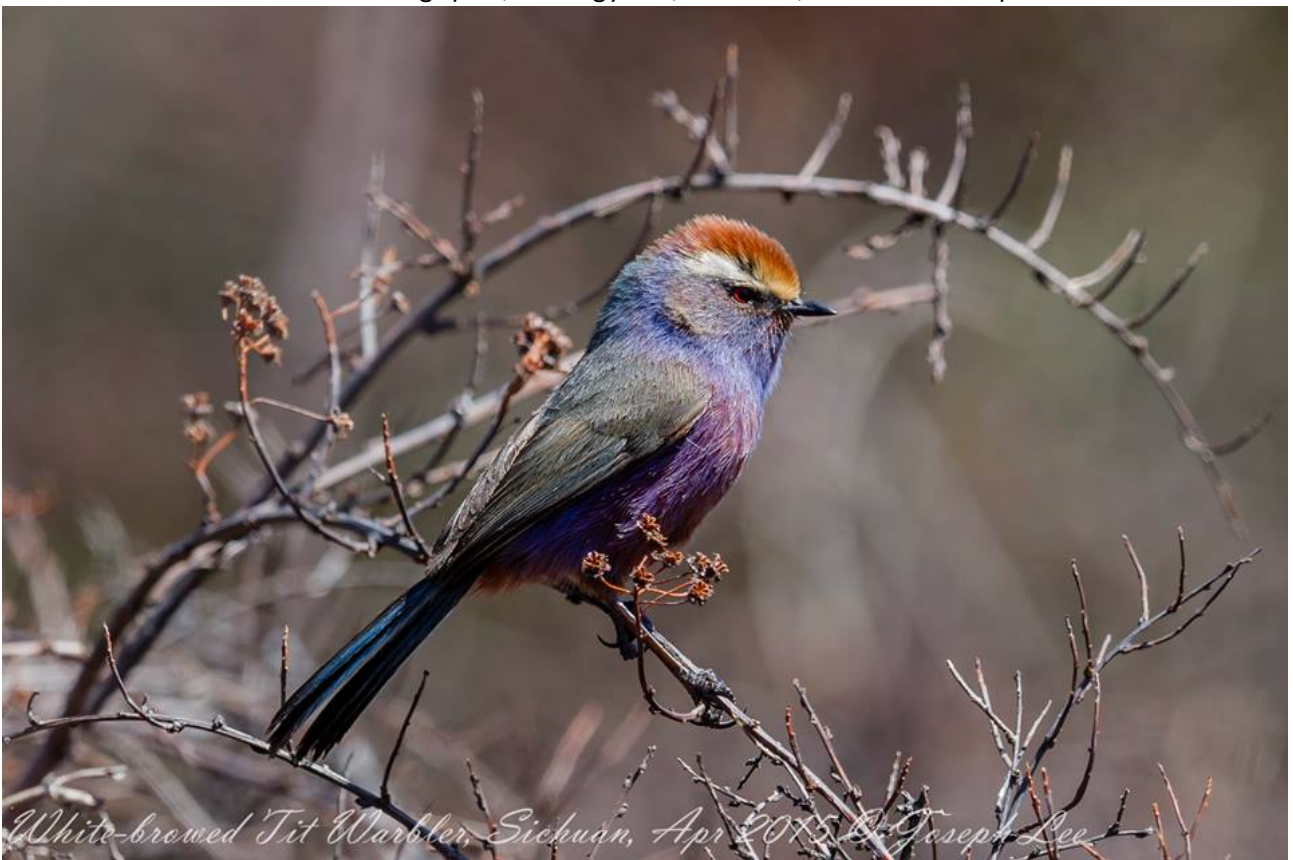
White-browed Tit Warbler, Northern Sichuan, China