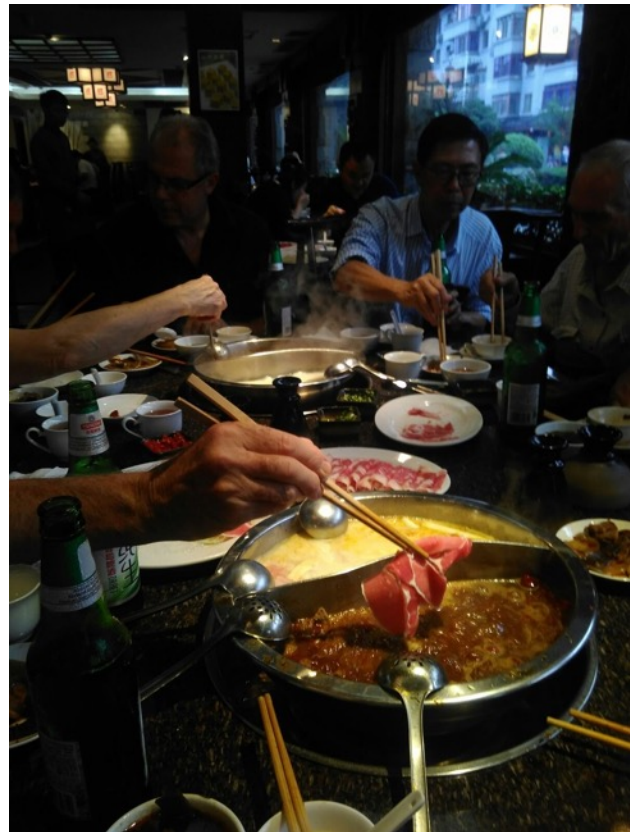
Hotpot dinner in Chengdu