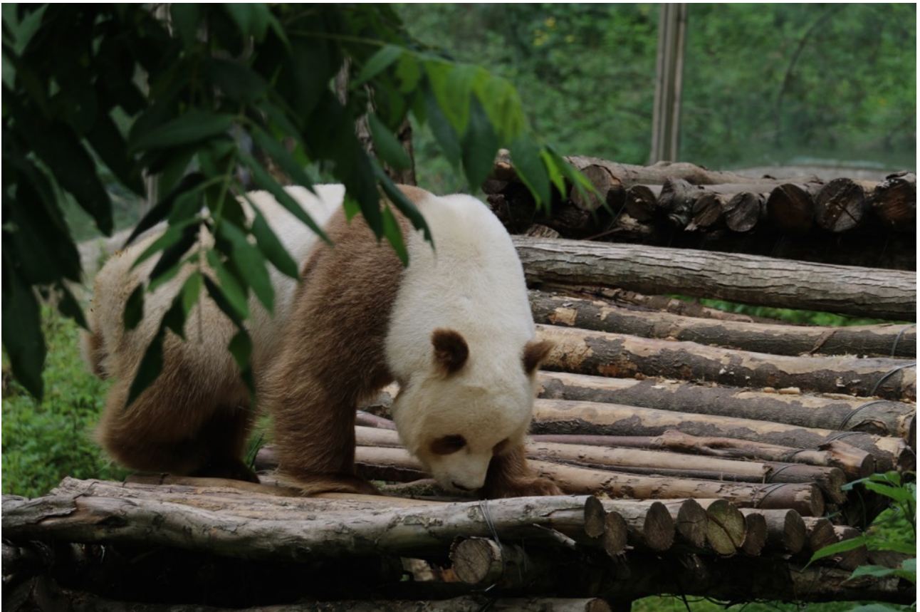
The unique chocolate color Giant Panda at Yangxian Panda Base

The Golden Snub-nosed Monkey is wild, from the Foping Panda Base where holds the unique Chocolate Giant Panda. The monkey trackers in the panda base went in the very early morning to the wild monkeys' sleeping place in the high mountain to push them to the lower area into a specific place in the panda base where tourists will come to visit, and stay with the money to keep them in the same place for the whole day until tourists left, the trackers said, without them to keep the monkeys stay around, the monkeys will leave the place within 15 mins into the deep forest. The monkeys go back to high mountain to sleep every day, so the trackers have to climb the mountain every morning to attract them into the panda base. And every 1-2 months, they will change a place to hold the money, otherwise the monkeys will destroy the trees and plants on that place. There is another park do monkey tracking too in Changqing, Shanxi, but that place's trees and plants were totally destroyed by monkeys as they didn't change place.