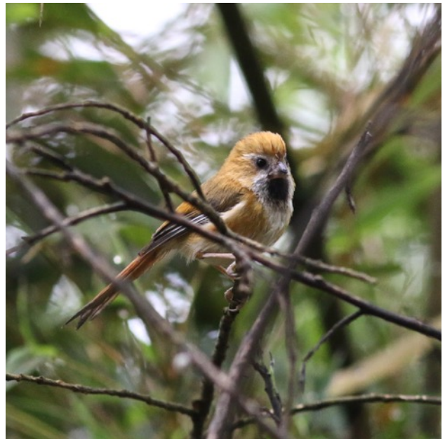
Speckled Wood Pigeon & Golden Parrotbill at Longcanggou