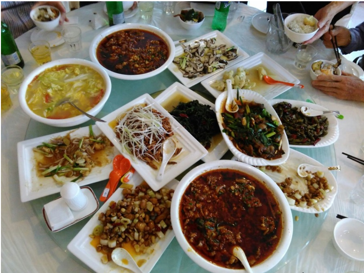
Sichuan Cuisine on tour