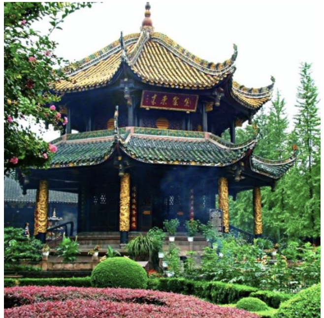
Qingyang Taoist Temple