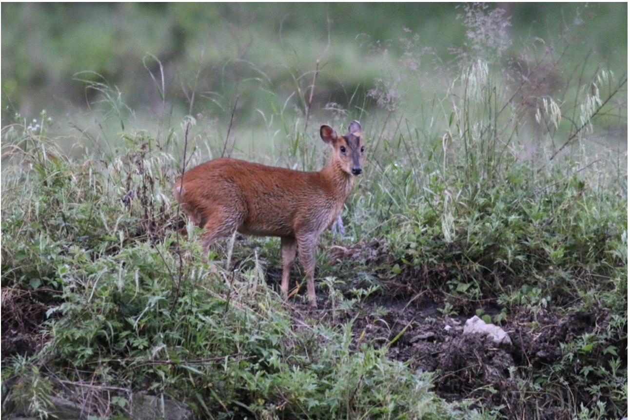
Reeve's Muntjac at Tangjiahe NNR