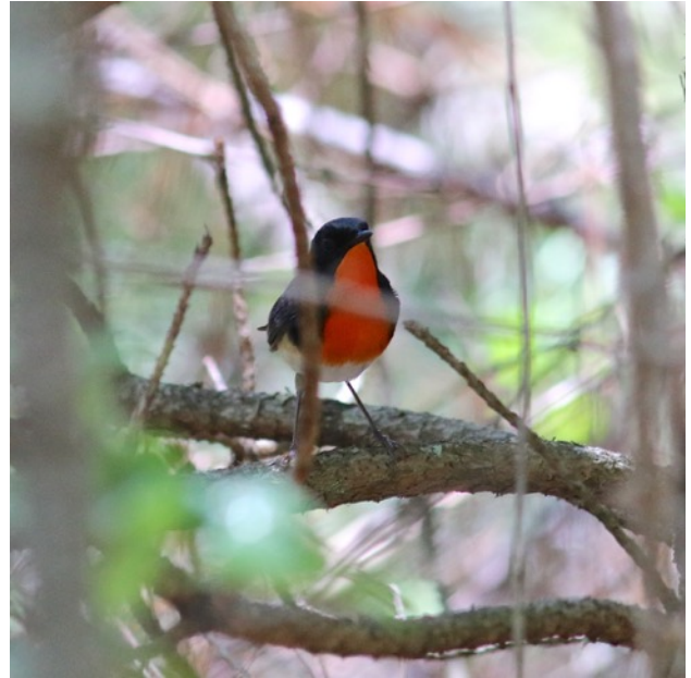
Rufous-tailed Babbler and Firethroat ( male ) at Erlang Shan