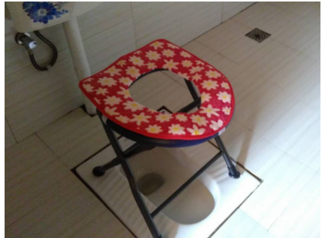
Toilet seat provided by Summer Wong