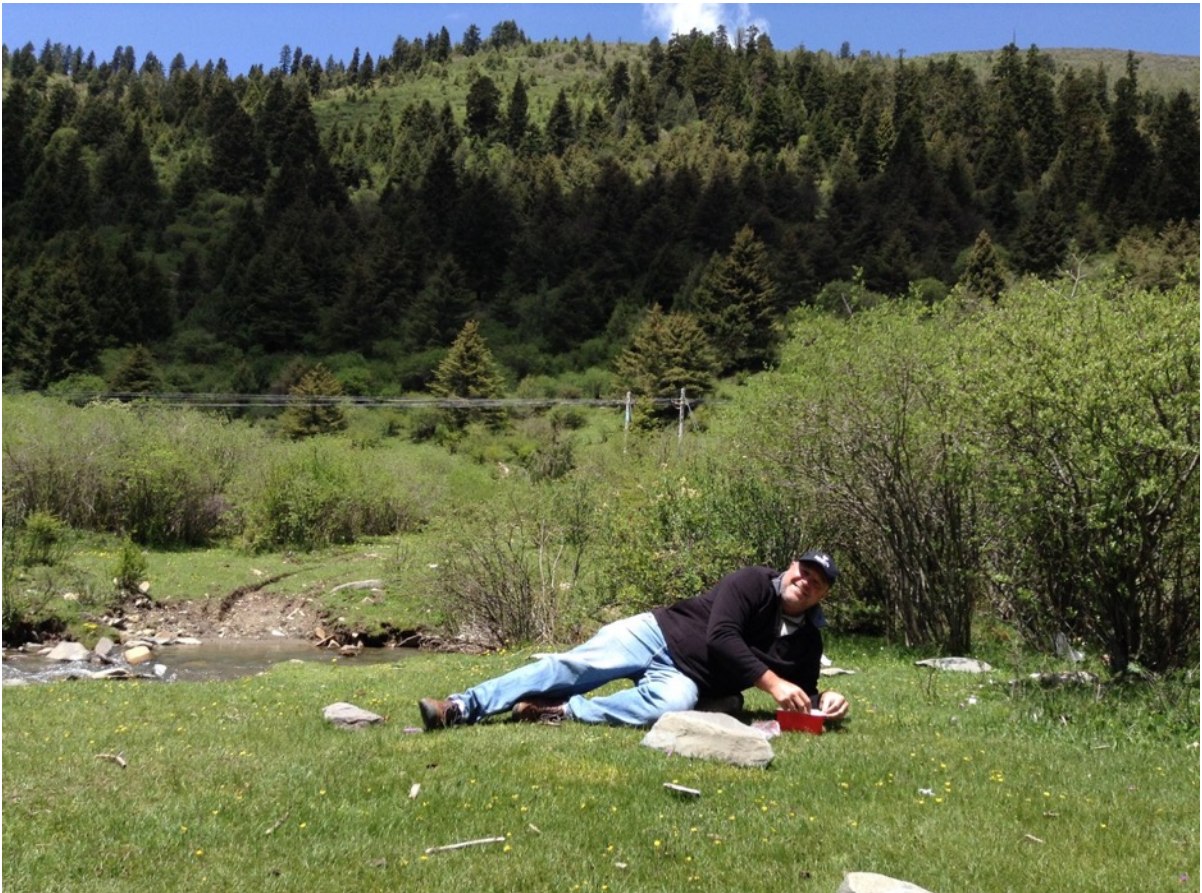
Field lunch in nice forest