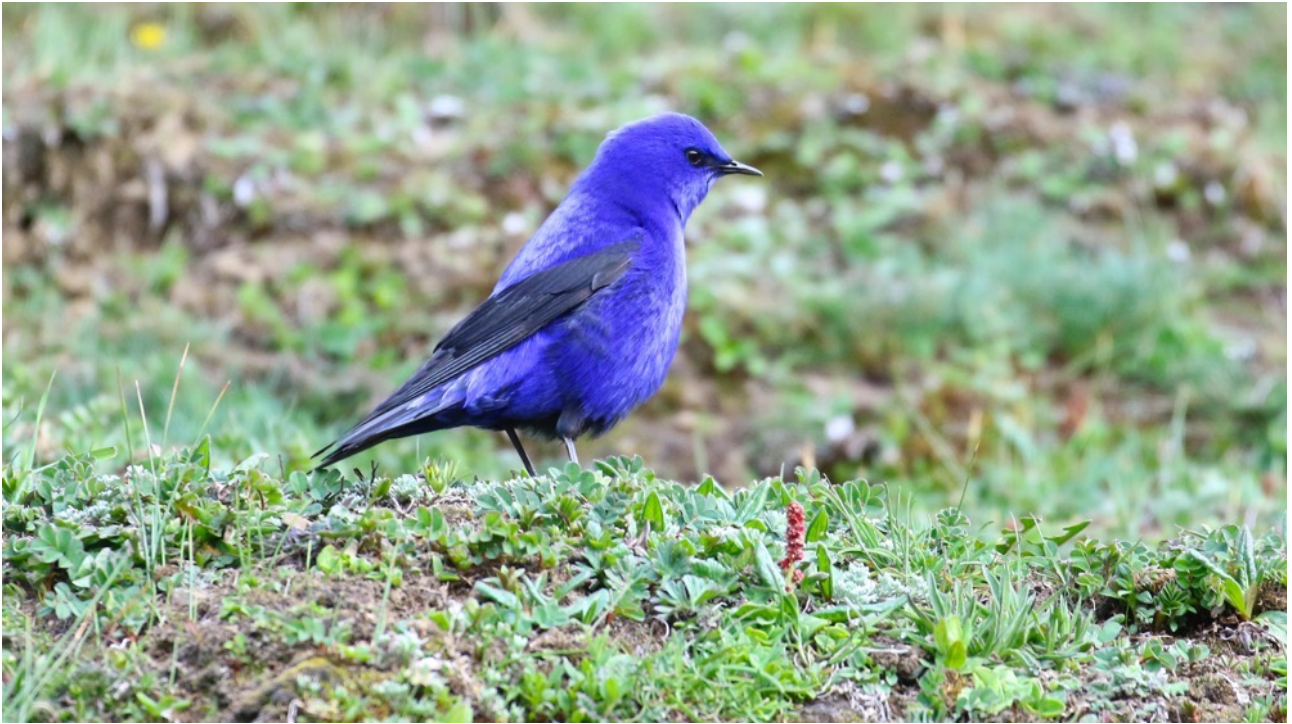
Grandala ( male ) © Vincent Lee at Balang Shan