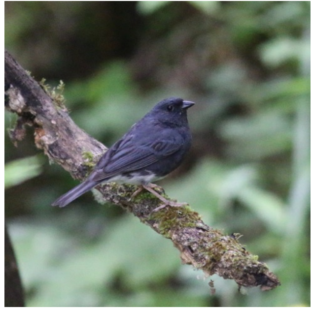
Slaty Bunting at Tangjiahe NNR