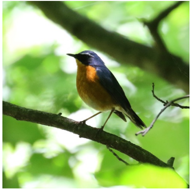
Pere David's Tit & Indian Blue Robin