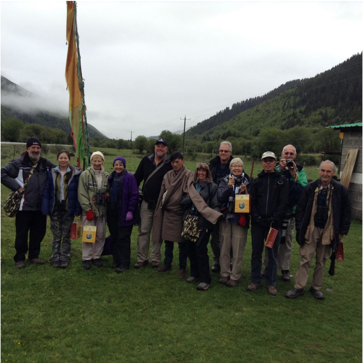
Group photo with the yak yoghurt boy