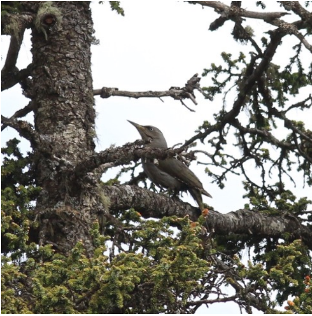
Grey-headed Woodpecker at Chuanzhusi