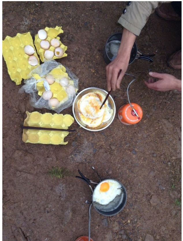
Noodle with fried eggs for field lunch and fried eggs with ham in breakfast sandwich