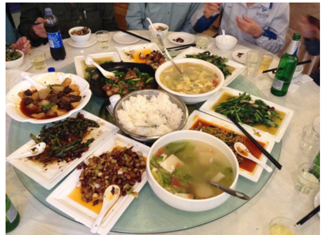
Dinner in Luding Hotel