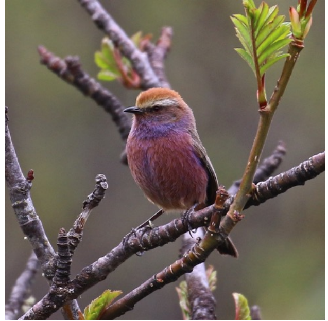
Blood Pheasant ( male ) & White-browed Tit Warbler ( male ) © Vincent Lee at Mengbishan