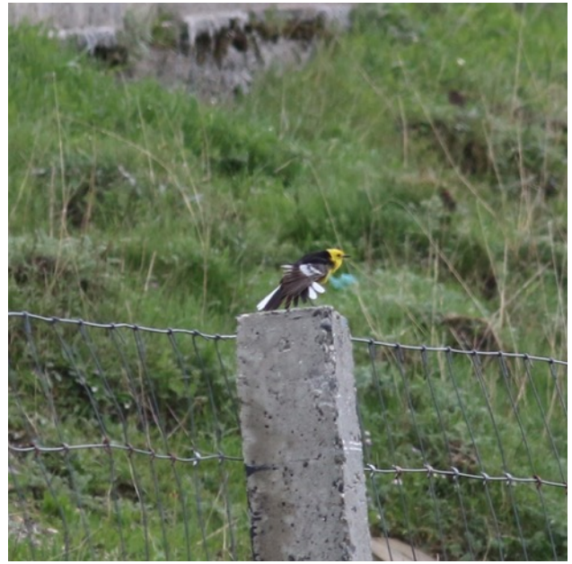
Black-necked Crane & Citrine Wagtail on the way from Maerkang to Ruergai