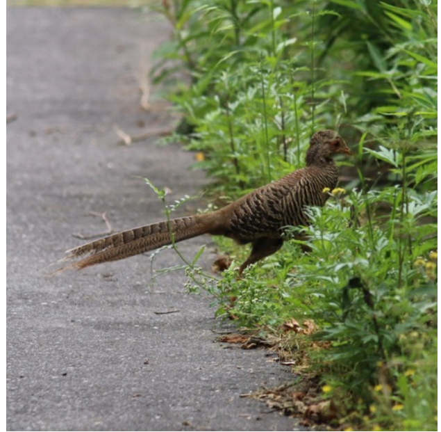
male and female Golden Pheasant at Tangjiahe NNR