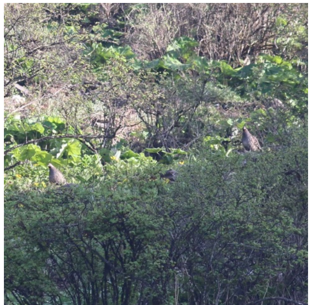
White-eared Pheasant & Chestnut-throated Partridge at Balang Shan