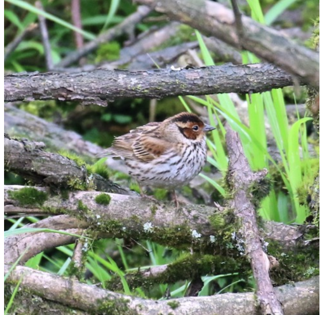
Spotted Bush Warbler & Little Bunting © Vincent Lee at Longcanggou