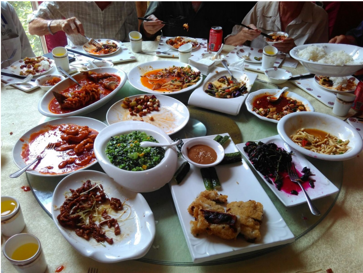
Summer Wong Bird Tour