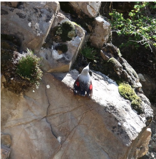
Wallcreeper at Xiaojin

On the way to Maerkang, we got Wallcreeper , Rufous-bellied Woodpecker and Black-capped Kingfisher . In Mengbishan, the highlight is watching Blood Pheasant crossing the road in front of us while we were hiding beside our coach, we were standing still, so it didn't pay much attention to us, even feeding on the concrete road, lucky that no other vehicle drove through at that time. White-browed Tit Warbler , Chinese Fulvetta , Chinese Beautiful Rosefinch , Pink-rumped Rosefinch were seen well on the top area. Three-banded Rosefinch gave a surprise in the morning, just flew in with a male White-browed Rosefinch perched on a pine tree top. Maroon-backed Accentor , Grey-crested Tit , Goldcrest , Yellow-streaked Warbler , Rufous-bellied Accentor and Winter Wren were showing well too.