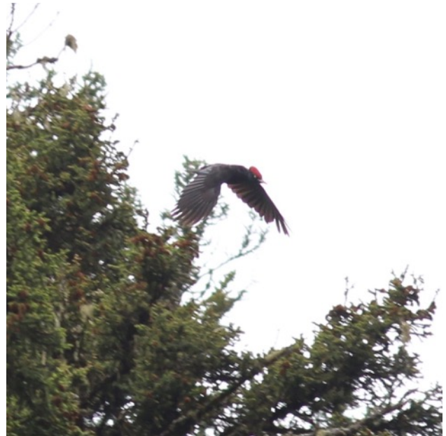
Przevalski's Nuthatch & Black Woodpecker at Ruoergai