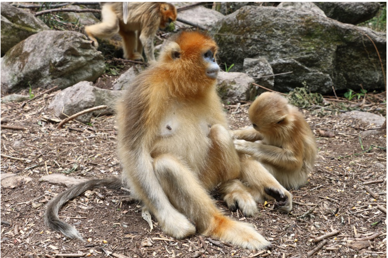
Crested Ibis © Vincent Lee & Golden Snub-nosed Monkey