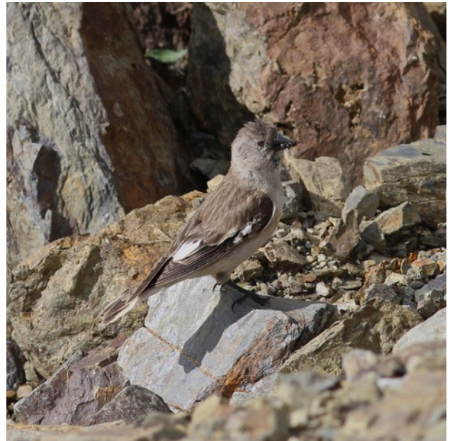
Tibetan Snowfinch on the way from Maerkang to Ruorgai