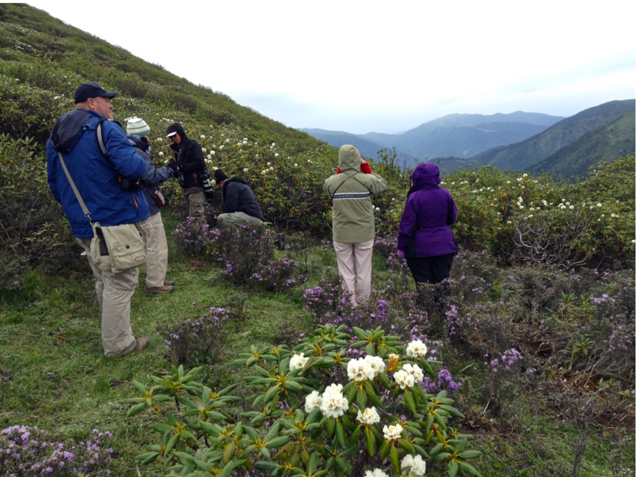
Birding in the beautiful Rhododendron at Mengbishan