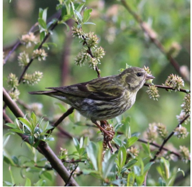
Tibetan Siskin male on left & female on right at Ruoergai