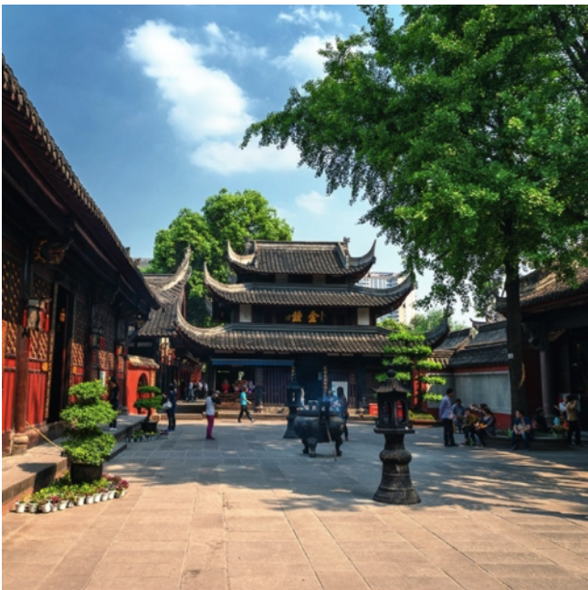
Wenshu Buddhism Monastery