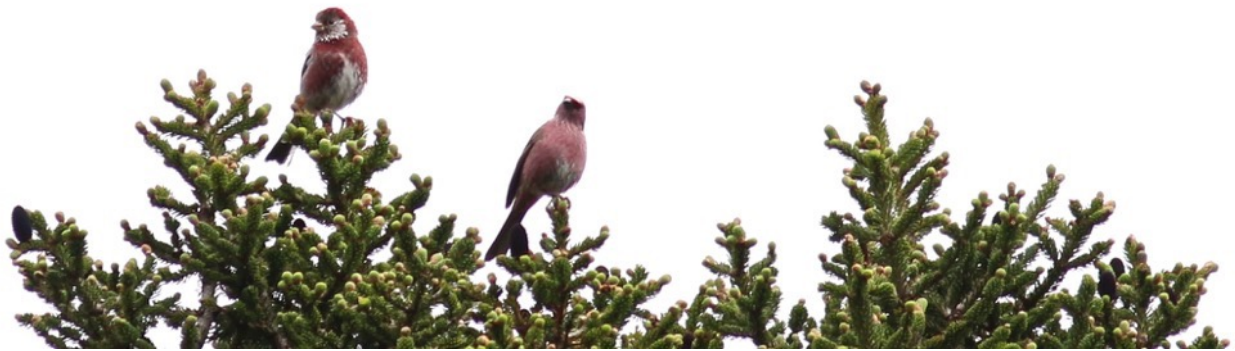
L. Three-banded Rosefinch ( male ) R. White-browed Rosefinch ( male ) at Mengbisha