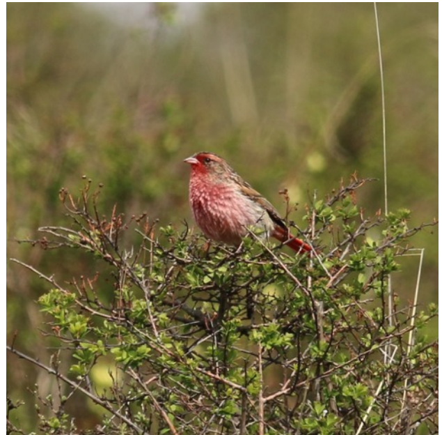
juvenile and adult Przevalski's Rosefinch ( male )