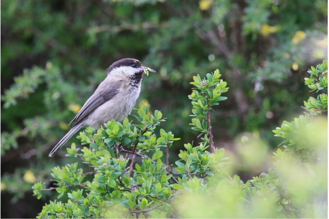
Sichuan Tit at Chuanzhusi

Thrush was singing on top of pine tree in the early morning. 2 Grey-headed Woodpecker were spotted in 2 difference place and time. 4-6 Tibetan Siskin feeding flowers on the bushes as well. Near to Jiuzhaigou NNR entrance we got great view of a Spectacled Fulvetta . Inside the park, got 3-4 Pere David's Tit , 2 Hodgson's Treecreeper, 3 Indian Blue Robin, 2 Slaty Bunting male and female.