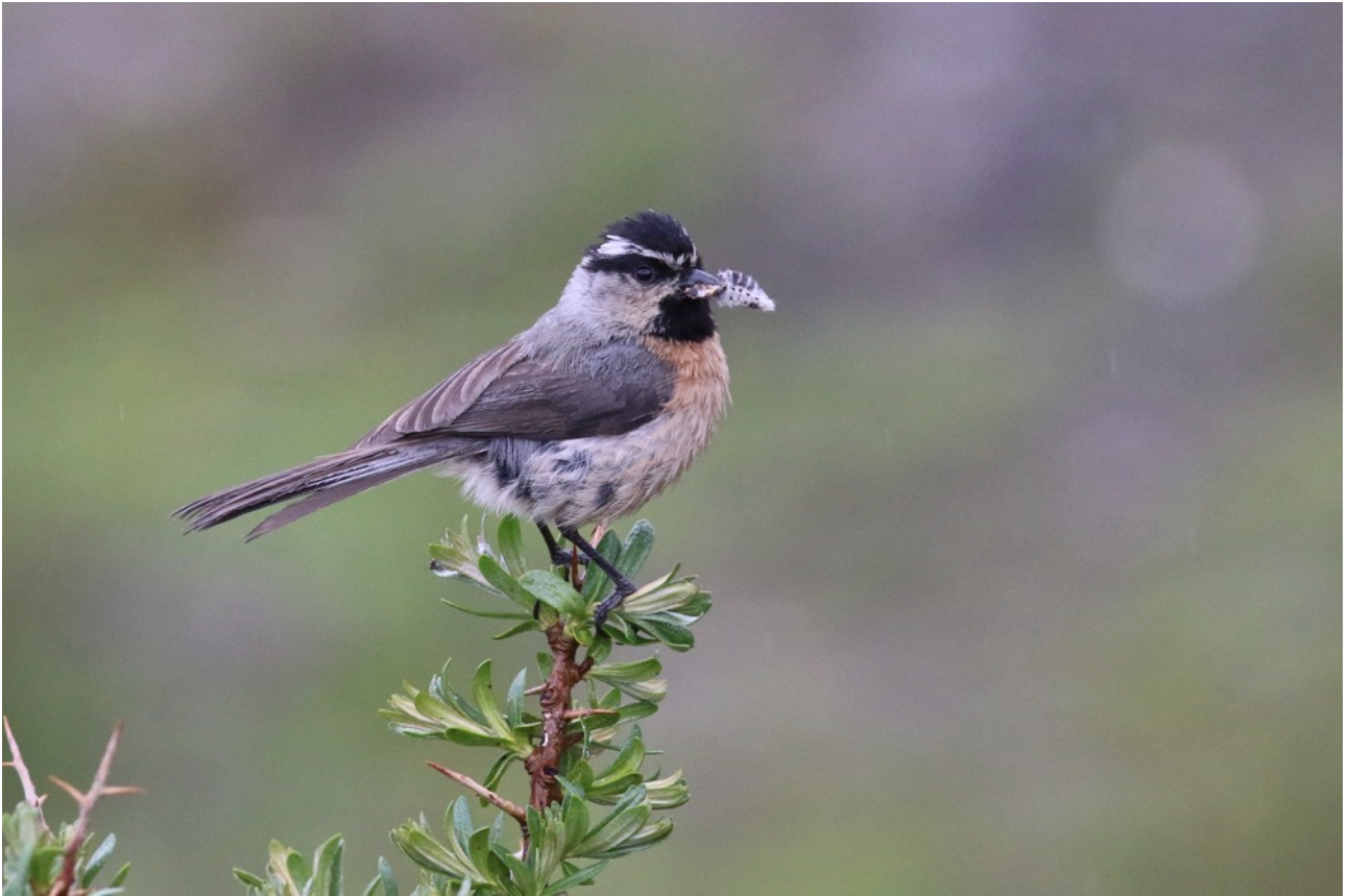
White-browed Tit on the way from Maerkang to Ruorgai