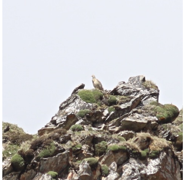
Snowcock Partridge & Tibetan Snowcock at Balang Shan