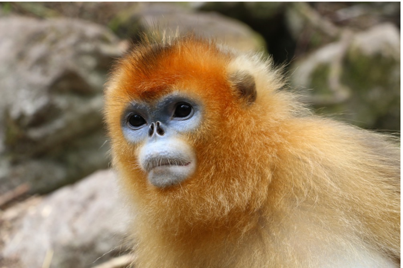
wild Golden Snub-nosed Monkey at Yangxian Panda Base