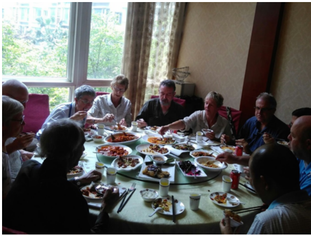
Sichuan Cuisine Lunch