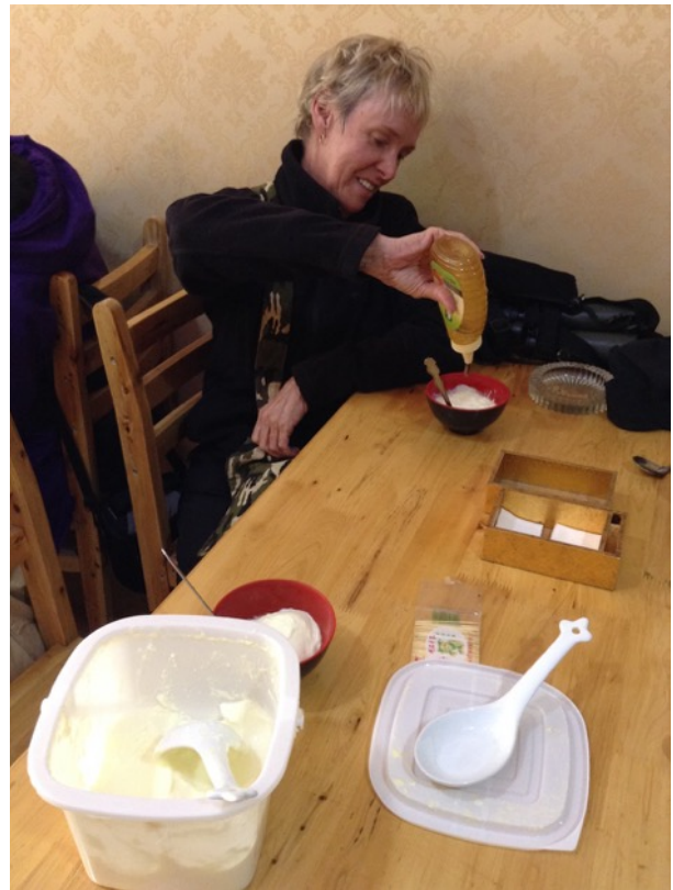
Home-made Yak yoghurt from a local tibetan family