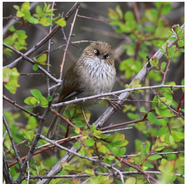
Chinese Fulvetta