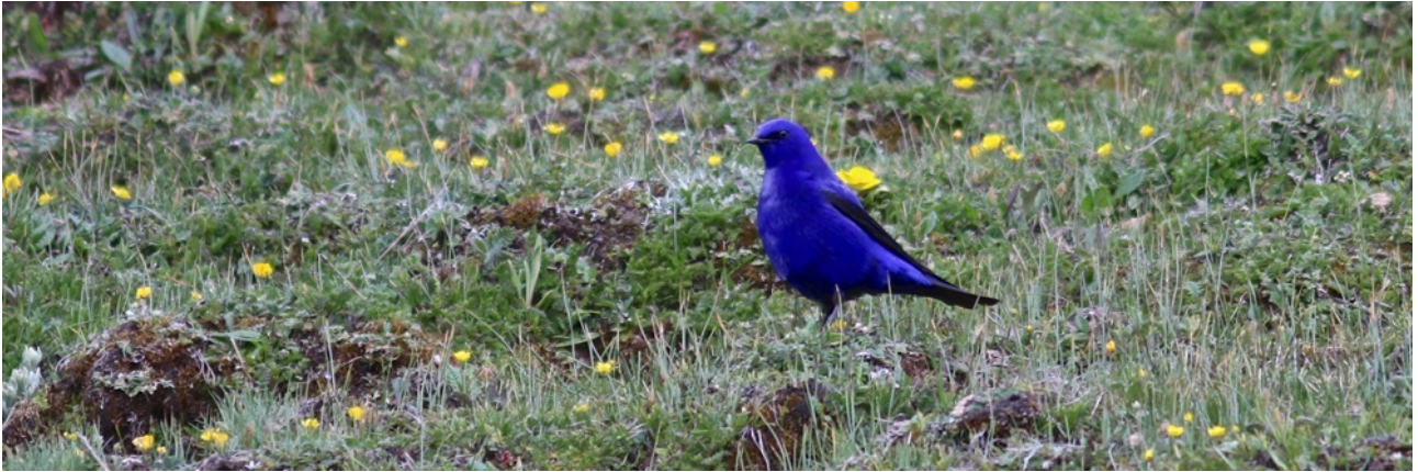
Grandala ( male ) at Balang Shan