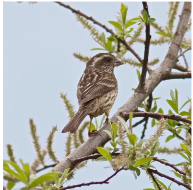
White-tailed Rubythroat ( male ) & Sharpe's Rosefinch ( female ) at Balang Shan