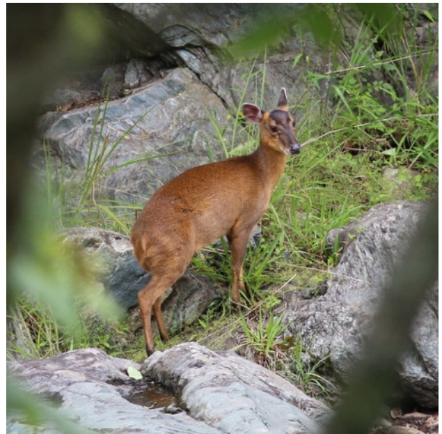
Takin & Reeve's Muntjac at Tangjiahe NNR