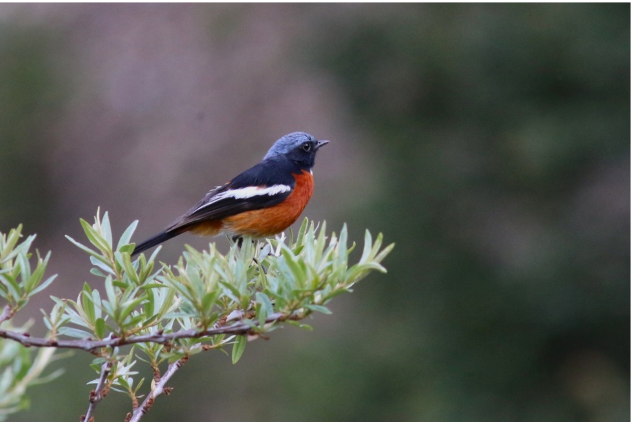
White-throated Redstart at Chuanzhusi