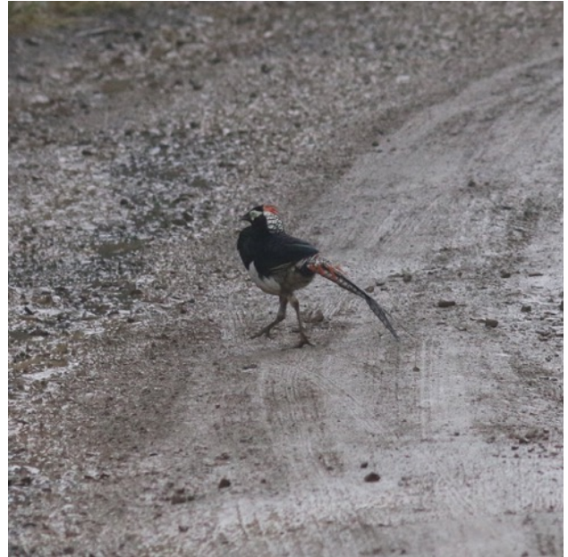
Temminck's Tragopan ( male ) & Lady Amherst's Pheasant ( male ) at Longcanggou