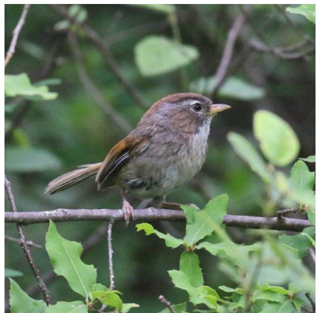
Three-banded Rosefinch & Spectacled Fulvetta at Jiuzhaigou