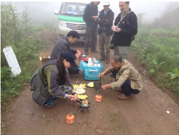
Frying eggs in the morning for breakfast