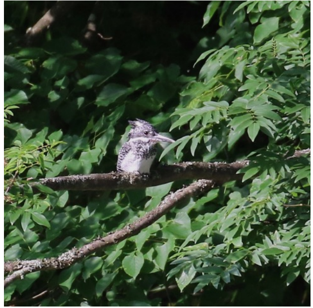
White-throated Laughingthrush © Vincent Lee & Crested Kingfisher © Vincent Lee